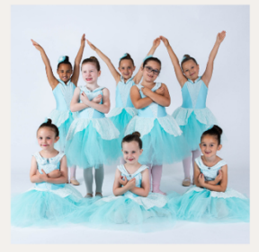
GET YOUR PICK OF CLASSES